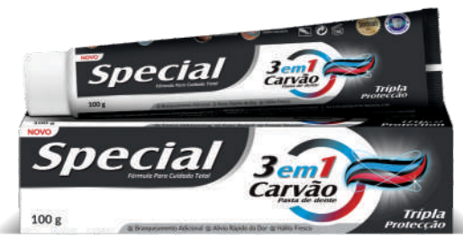
Charcoal 3 in 1