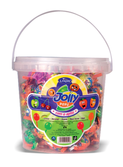
JOLLY POP BUCKET