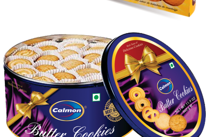
BUTTER COOKIES IN TIN BOX