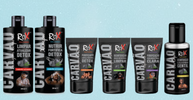
Rox Man Charcoal Range