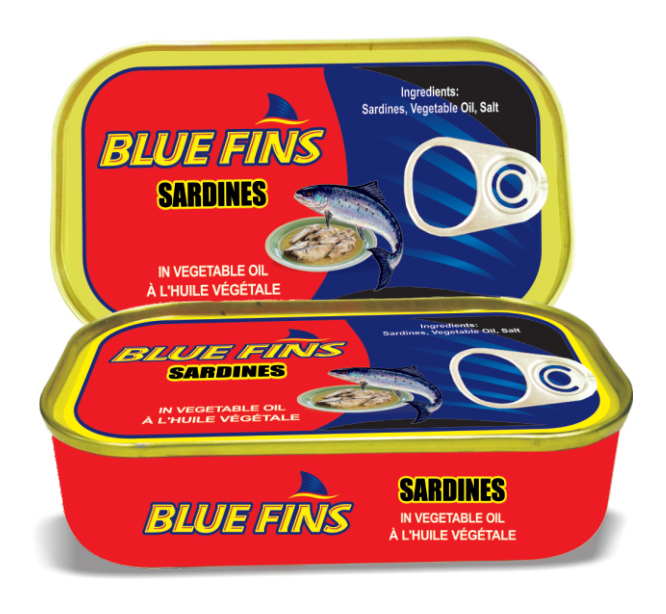
BLUE FINS SARDINE