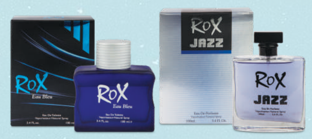
Rox Eau De Perfume