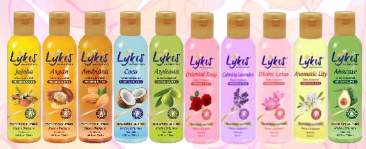
Premium Body Oil