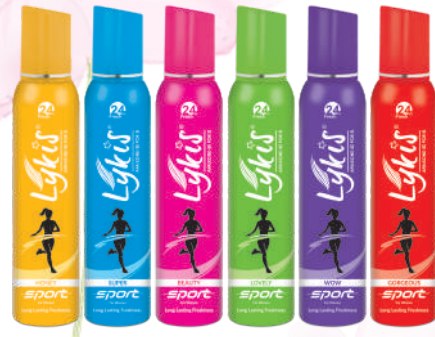
Lykis Sport Deo