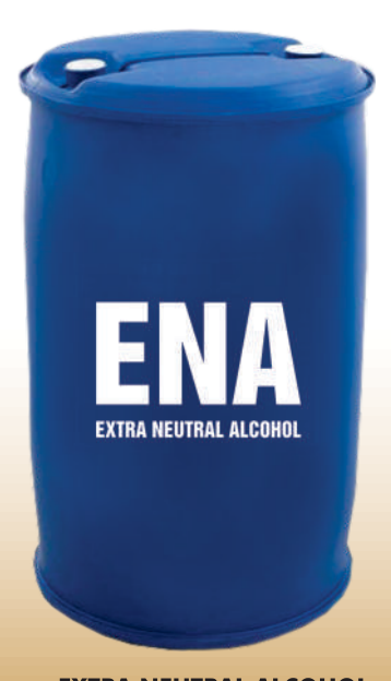
EXTRA NEUTRAL ALCOHOL ( ENA )