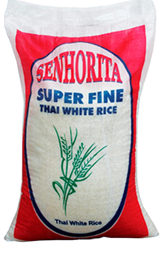
THAI WHITE RICE