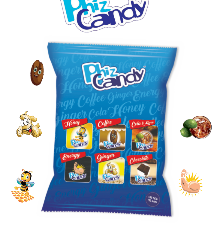
PHIZ CANDY ASSORTED