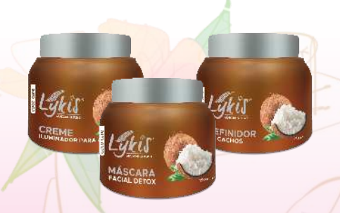
Cream, Curl Definer & Face Detox Mask