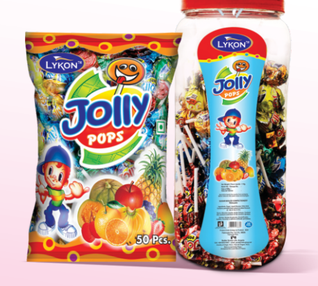
JOLLY POP POUCH & JAR