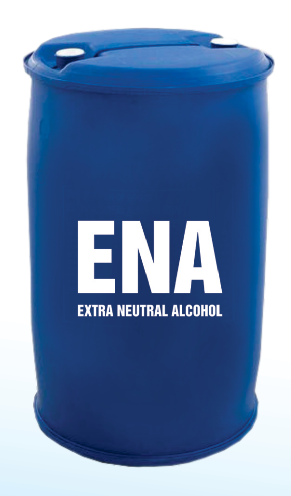
EXTRA NEUTRAL ALCOHOL