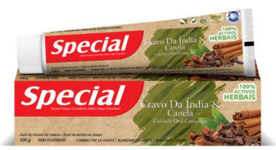
Clove & Cinnamon