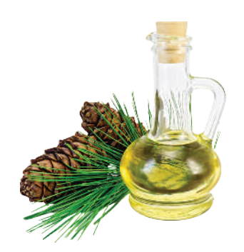
PINE OIL 90%