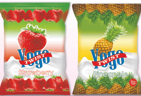
YOGO TWIST CANDY