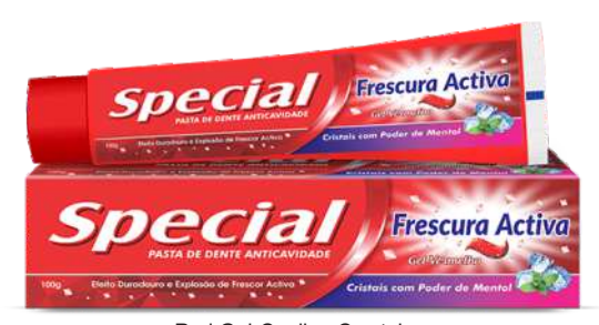
Red Gel-Cooling Crystal