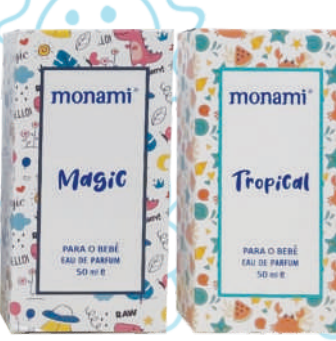
Grystal . Tropical 5 Magic Candy