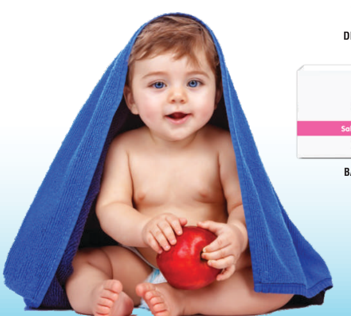
DIAPER RASH CREAM