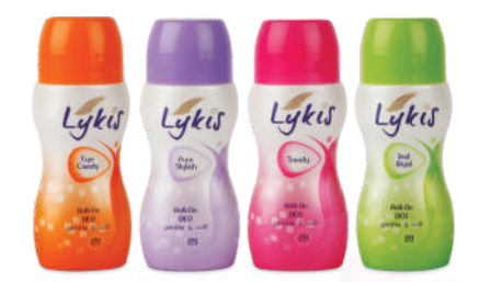
Deo Roll On