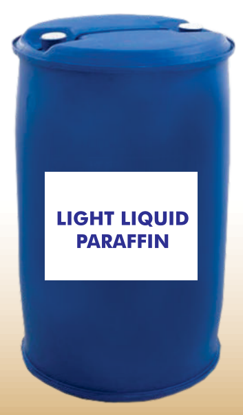
LIGHT LIQUID PARAFFIN ( LLP )