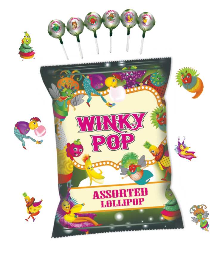
WINKY POP ASSORTED LOLLIPOP