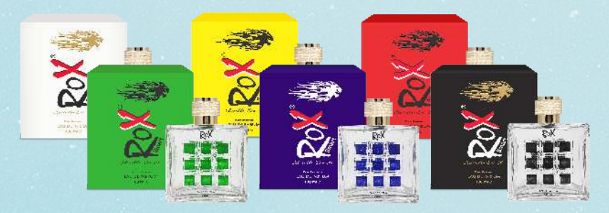
Rox Smart 100ml Perfume