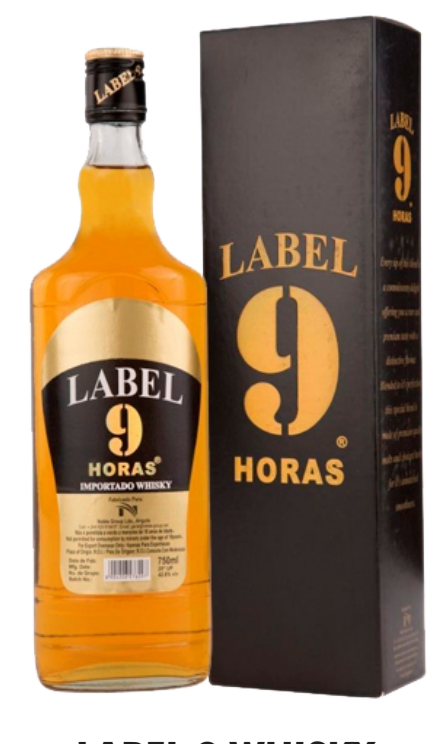
LABEL 9 WHISKY