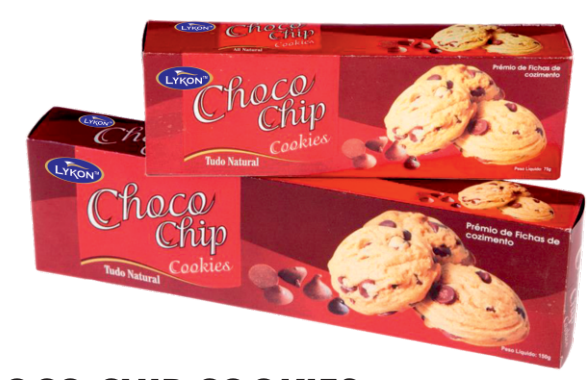
CHOCO CHIP COOKIES