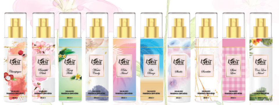
Glitter Mist Without Shimmer