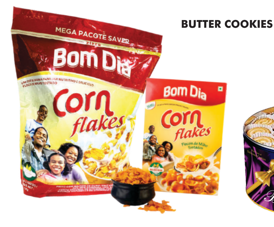
BOMDIA CORN FLAKES